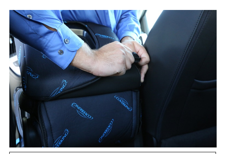
Tuck the back of the console cover over the rear corners of the top console