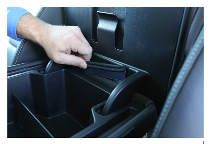
Insert the plastic tab between the seat fabric and plastic tray