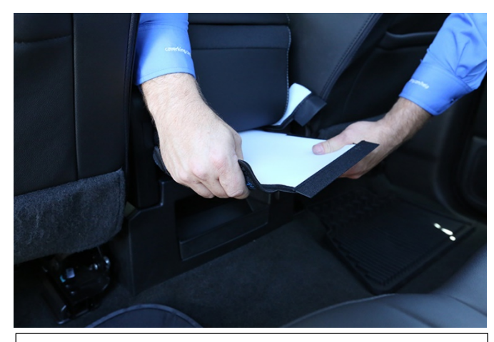
Pull the fabric tightly through the seat back and bottom