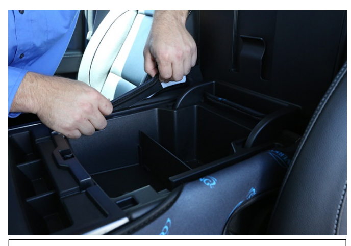
Insert the side tabs between the seat fabric and the plastic console