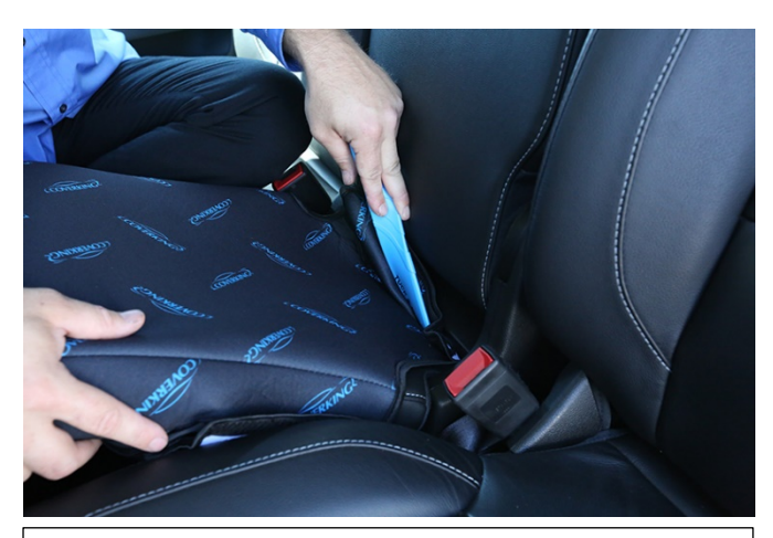
Using the provided tool tuck the fabric between the seat back and bottom