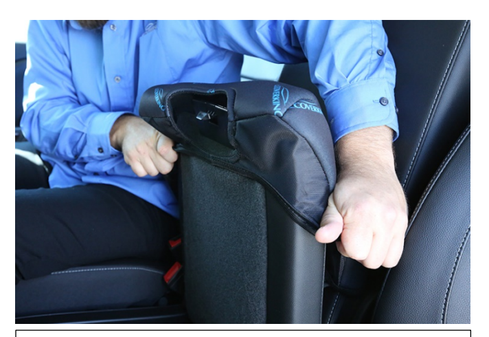
Slide the seat bottom over top of the latch and snuggly against the seat top