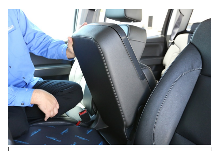
Lower the seat back slightly