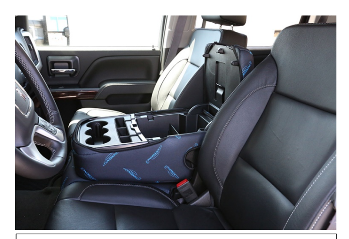
This photo shows the final installation with the 20 portion in the lowered position with the console lid open