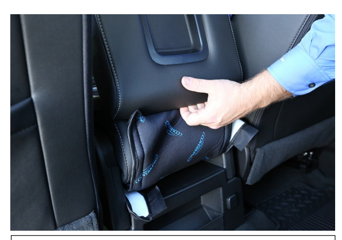
Tuck the fabric between the console lid and seat back