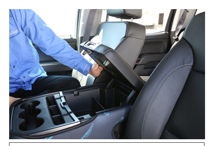
Lift the console lid