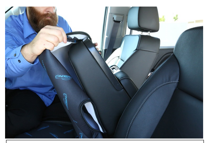
Slide the seat back cover so it sits firmly against the top of the seat back