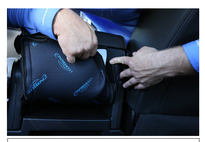
Attach the seat back and bottom together starting with the lower Velcro strips first