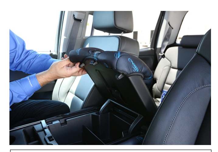
Slide the console cover over top corners of the lid