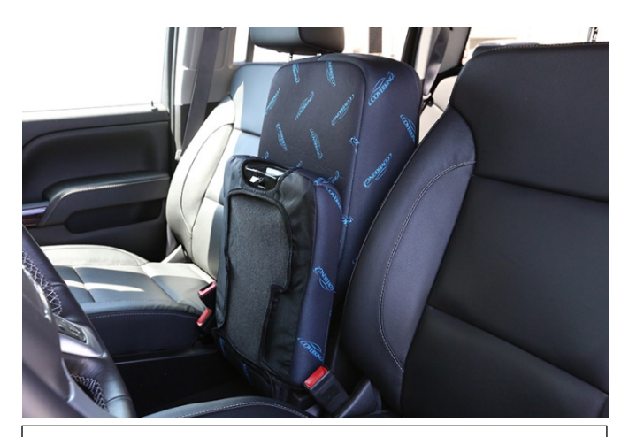
This photo shows the final installation with the 20 portion in the lifted position with the lower console open

This photo shows the final installation with the 20 portion in the seated position