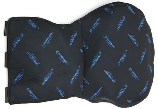
Seat bottom for seats with a lower storage option