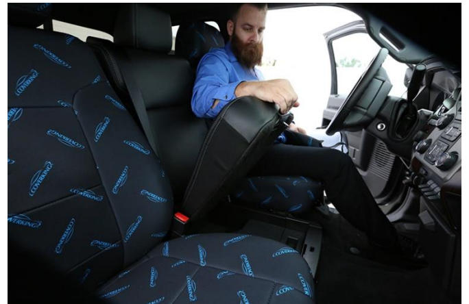
Start by lifting the center console bottom