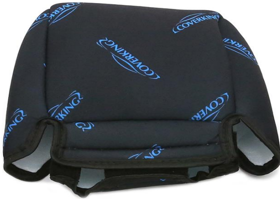
Middle console headrest cover