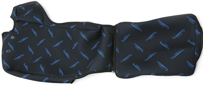
Seat bottom and console cover