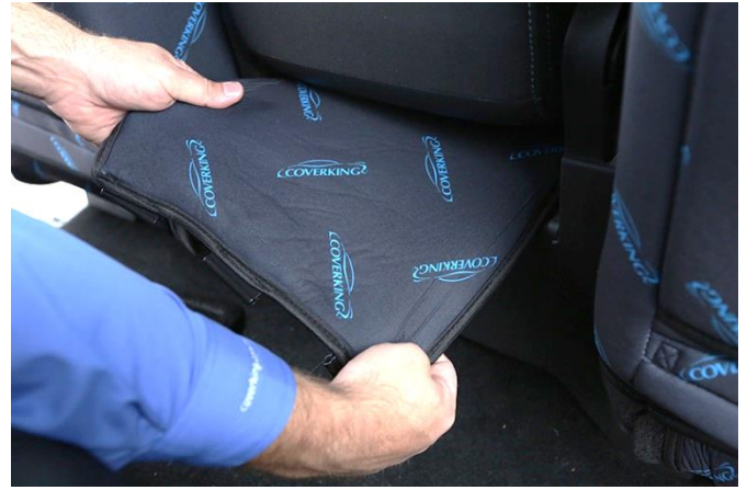
Pull back on the material so it sits tight on the seat bottom