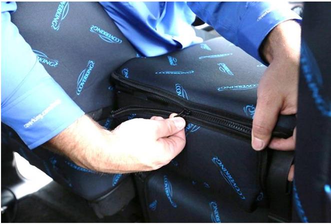
Zip the console cover onto the seat back