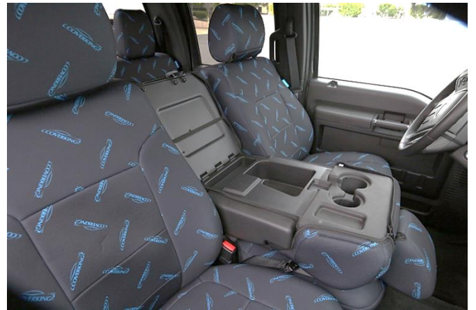
Finished photo of the console lid open