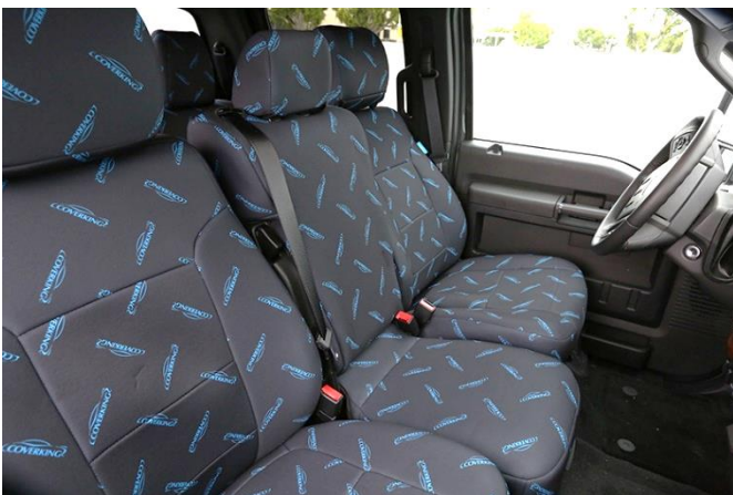
Finished photo of the seat back in the upward position