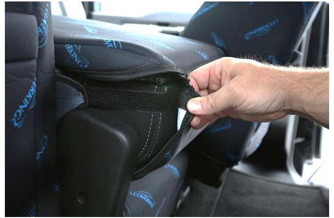
Pull the Velcro strap so the seat back fits tightly and attach it to the bottom of the cover