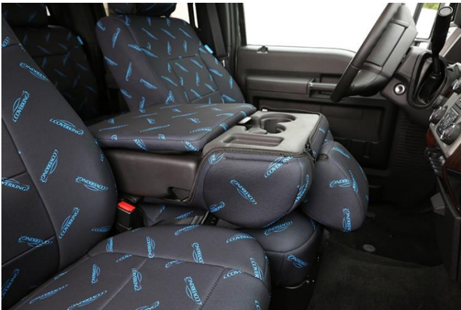
Finished photo the console in the lowered position