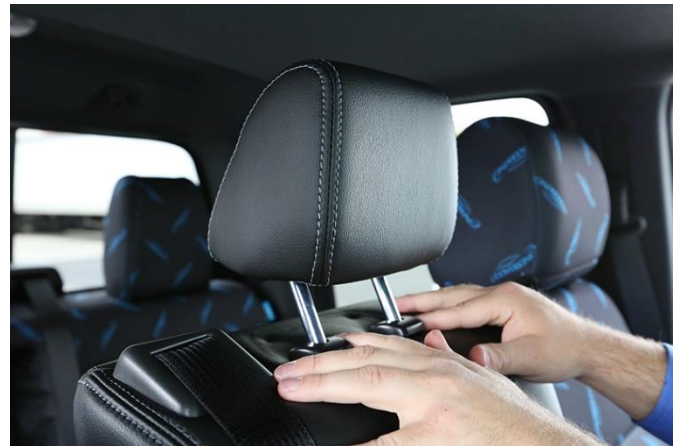
Remove the headrest from the seat back by depressing the two tabs and pulling straight up.