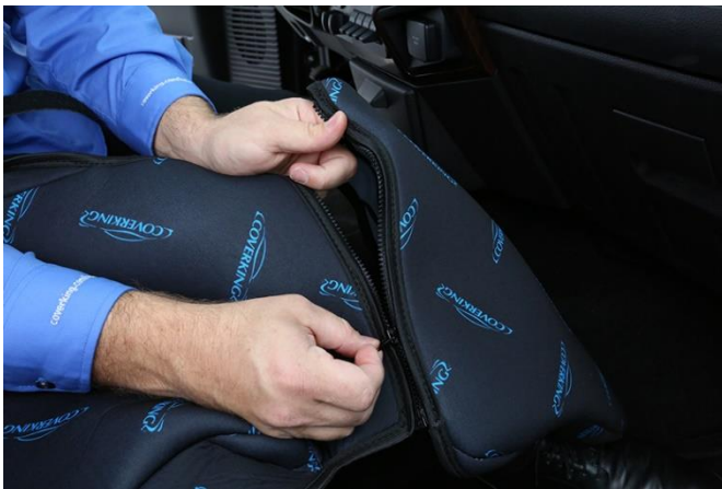
Unzip the seat back from the console cover