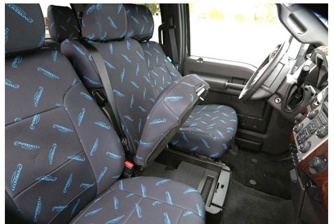
Finished photo of the seat bottom in the upward position