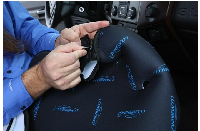
Unzip the access hole for the seat belt