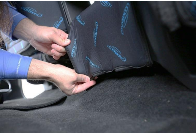
Pull downward on the material and clip the J hooks onto the lower trim