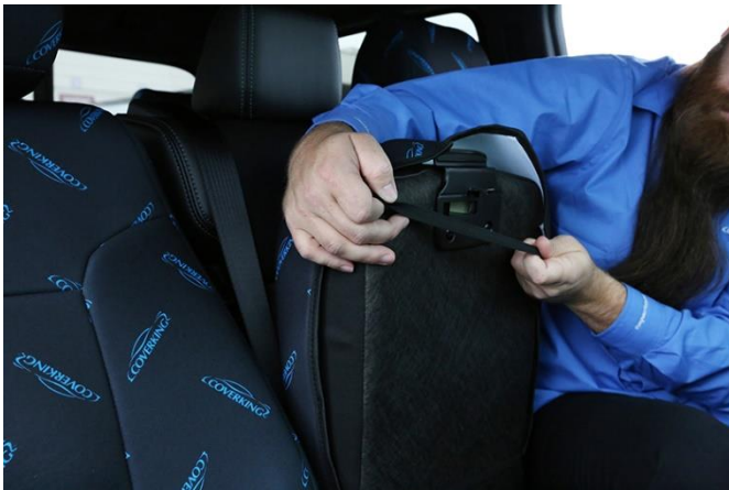
Slide the seat bottom with the elastic strap over top of the lower latch