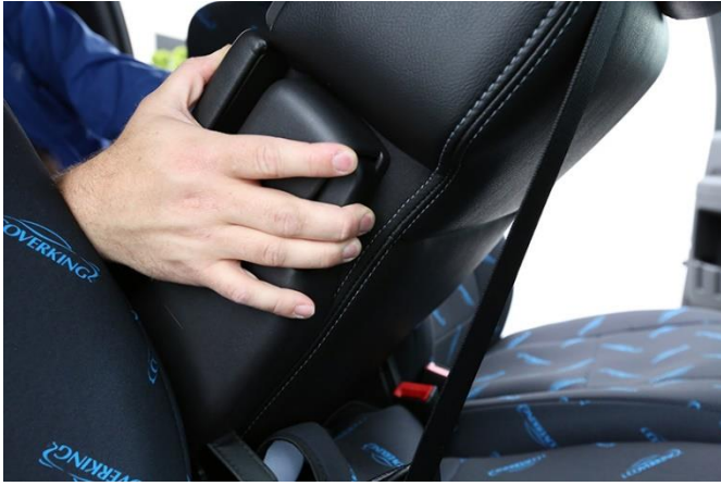
Lower the seat back