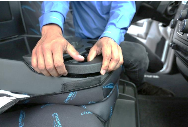
Lift up on plastic trim and remove it, the trim is held in place with four plastic pins.

NOTE: Most materials will fit underneath if the cup holder trim, thicker materials such as Rhinohide / Leatherette / Saddle will be a tighter fit and may require the trim to be on the outside edge of the cupholder.