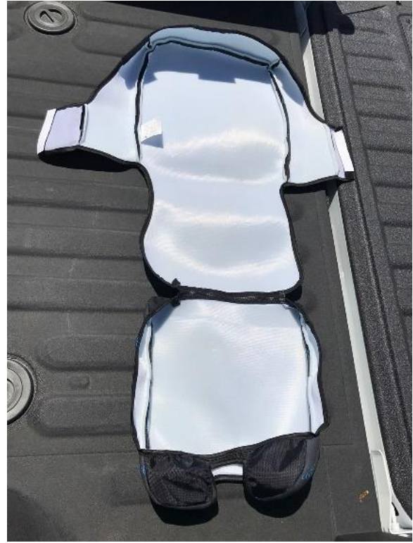
Upper and middle console cover underside