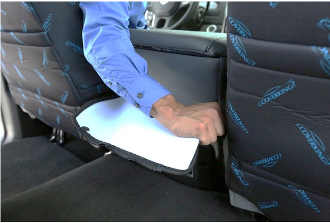
Lower the seat back then pull the fabric so the fabric is tight against the seat top.