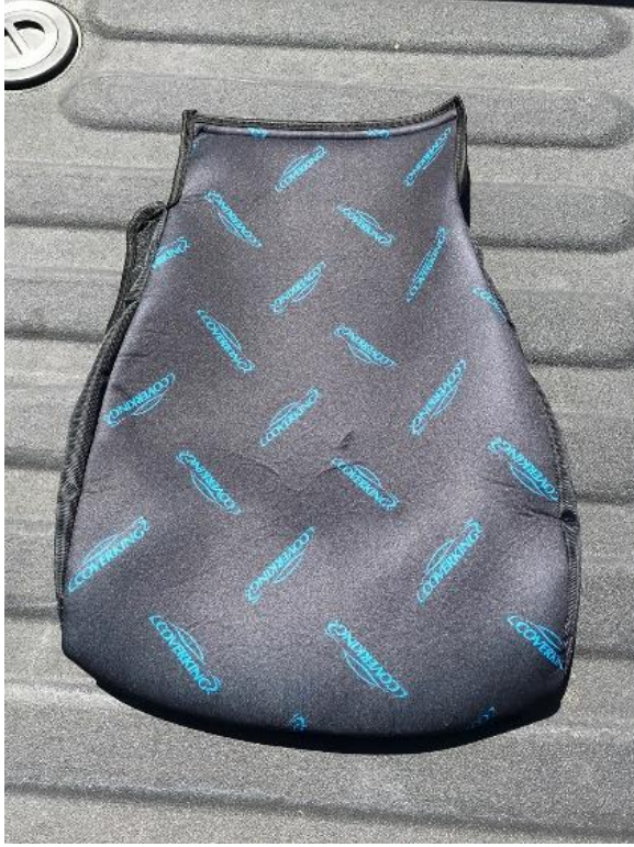
Bottom storage cover topside