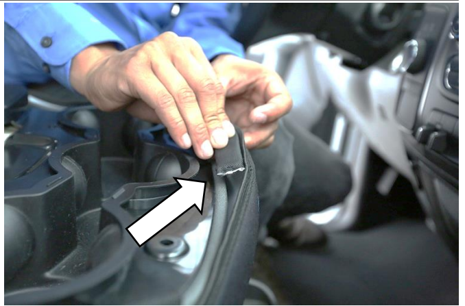
Roll the tabs inward so they sit above the factory backrest material.