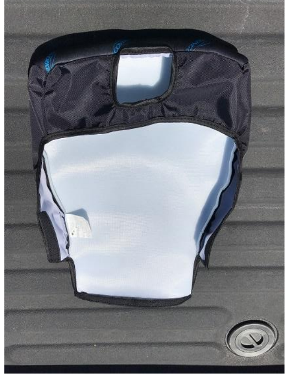
Bottom storage cover underside