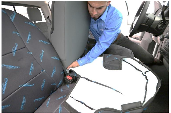
Unzip the console cover and pull the seat back fabric between the seat bottom and back.