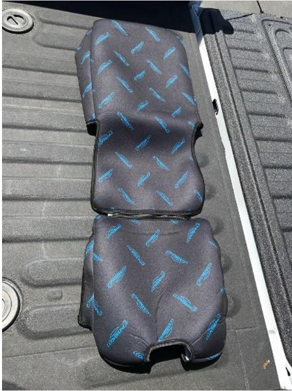
Upper and middle console cover topside